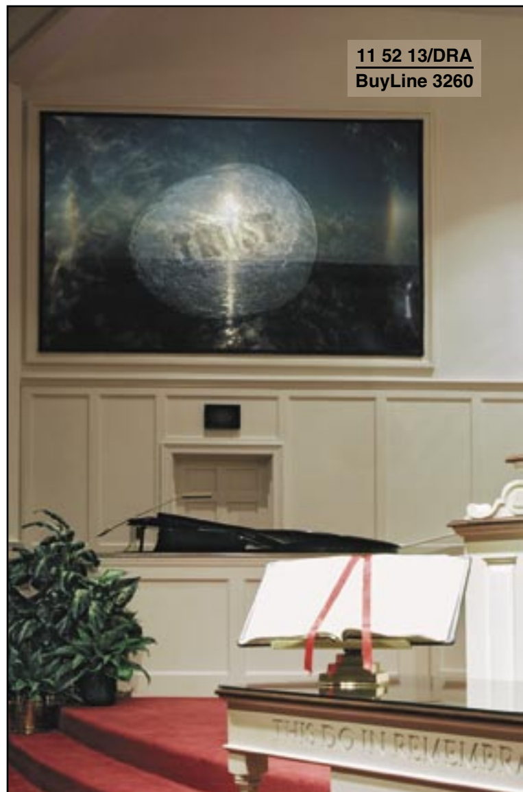
Cineperm installation in the First Baptist Church of Sebring, Florida. Installation: Bassett Electronics, Inc., Sebring, FL.