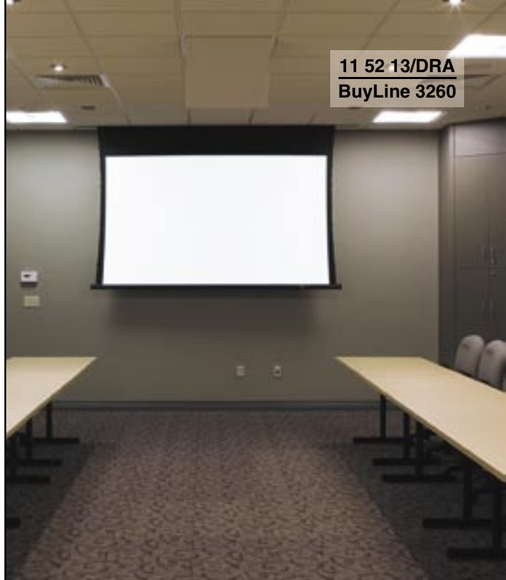
U.S. Patent Nos. 5,341,241, 6,137,629, 6,421,175 and 6,532,109. Other patents pending.